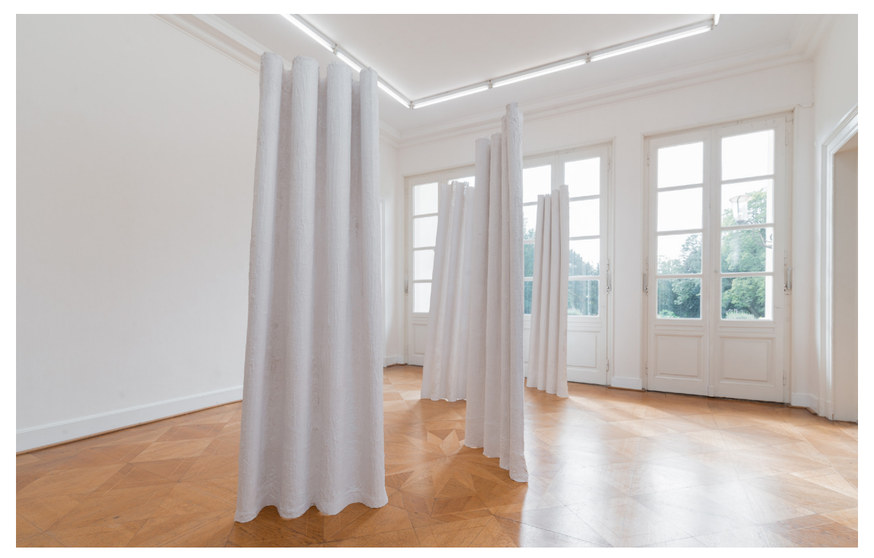
Stehende Vorhänge (Standing Curtains), 2017 installation view "Inge Mahn | Nora Schultz", Kunstverein Braunschweig, Germany, 2017 fabric soaked in plaster dimensions variable

Inge Mahn's early work "Hundehütten" (Doghouses, 1976) symbolizes human existence in a different way. The piece reminds one of the phenomenon of standardized row houses that in its diminished dimensions appears grotesque. In contrast, the "Gestiefelte Säule" (Column in Boots, 2016) stands in the room totally autonomously and functionless on two black boots. The usual basic order of lending support and being supported is mixed up.