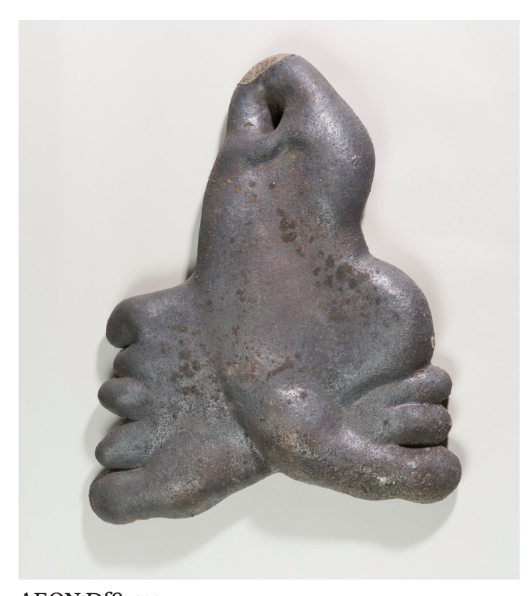
AEON Df8, 2021 ceramic, natural fly-ash-glaze 15 × 55 × 50 cm

The title of your current show at our gallery is "Water from the Source." The exhibition features a group of new ceramics and paintings. On several levels, we see collections of abstract shapes, body elements or factually the collection of ceramics in the room. The title, "Water from the Source," simultaneously alludes to the concept of resource that you have been interested in for quite a while. What are the most important aspects of the exhibition in your view?