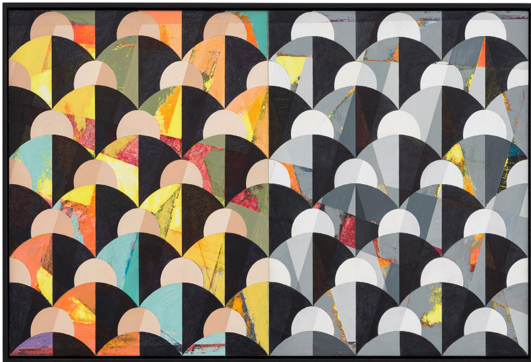
Bernd Ribbeck Untitled, 2022/016

Bernd Ribbeck (DE 1974) lives and works in Berlin. His works have been shown in numerous international exhibitions and are represented in several institutional collections such as Museum of Modern Art New York, Museum Haus Konstruktiv Zurich, Sammlung de Belvedere / 21er Haus Vienna, Städtische Galerie im Lenbachhaus Munich, Kunstpalast Düsseldorf or the Wilhelm-Hack Museum Ludwigshafen. His solo exhibitions at Haus Konstruktiv in Zurich and Wilhelm-Hack Museum Ludwigshafen are accompanied by a comprehensive publication by Distanz Verlag.