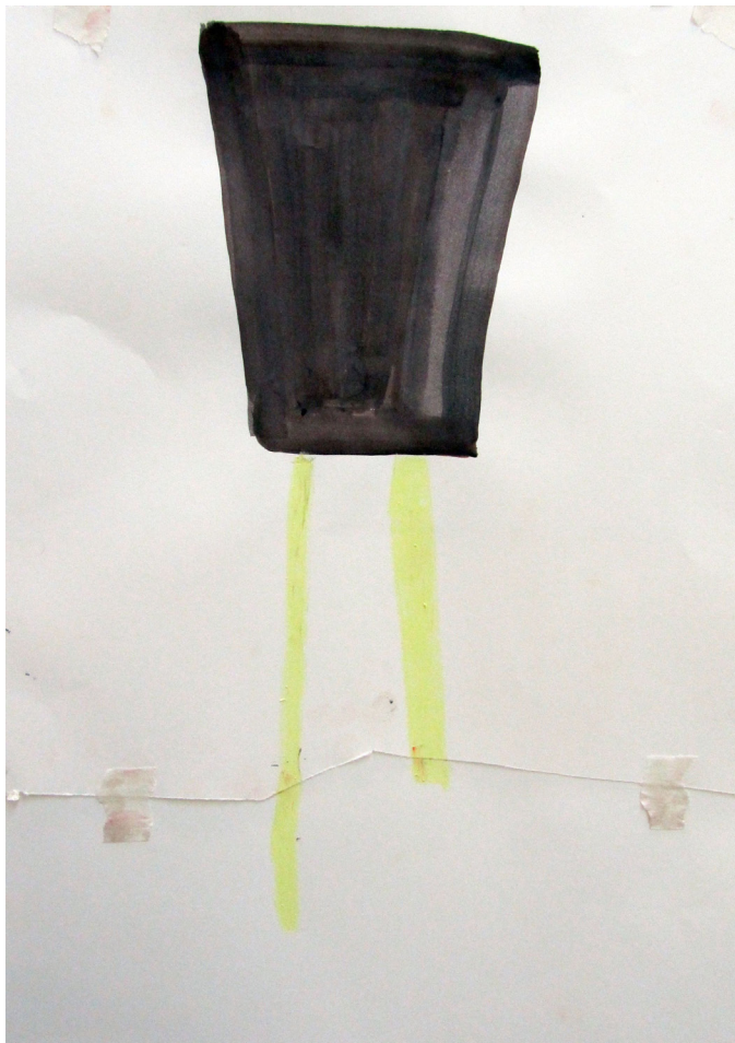
Untitled , 2014 watercolor, wax crayons, crepe, 40 × 29,5 cm

The artist's sculptures and works on paper are created in relation to each other and consistently interact. Questions specifically related to the space are included in this interplay and are crucial for presenting the works. The modular treatment of the sculpture plays a central role: The arrangement and expansion of the concrete slats and the plaster flakes stacked on them are variable and adapted to the gallery space.