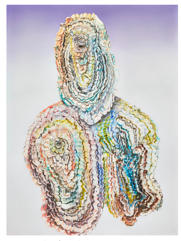
Neonatal refractions No 30, 2018 oil and varnish on MDF 104 × 76 cm

They resist any kind of physiognomic, gender-related or ethnic classification. The title, "Neonatal refractions", alludes to a fictive, post-humanistic approach of expanding the physical process of refraction in order to conceptualize new states of being or modes of perception via its changes.