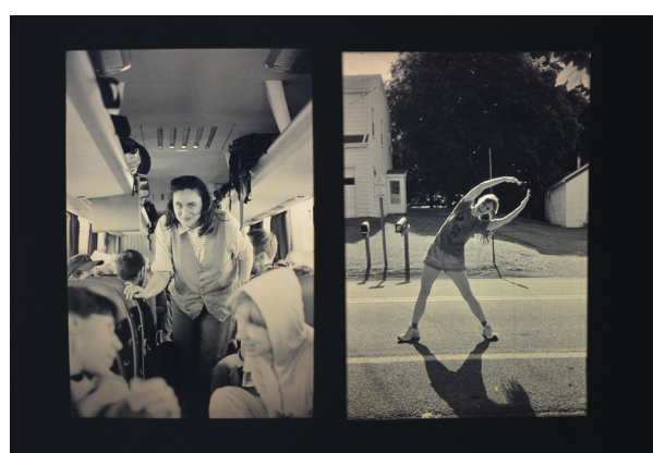
51 Ein Bild von dir, in dem ich dich wiederfinde.

EIN BILD, 2015 3 channel slide projection 243 slides dimensions variable