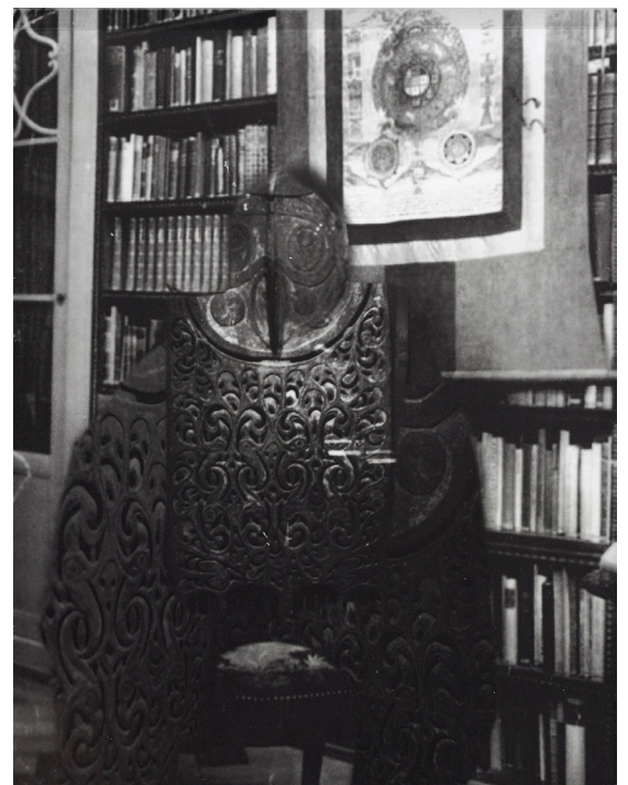
The symbolist , 2015 photogram 19 × 15 cm

In Bool’s floor works made of Carrara marble, the perspectives between illusionistic and real space collapse. In the Italian Renaissance, Carrara marble was the material for geometric inlaid works whose rigidity symbolized fixed earthly and religious hierarchies. Bool’s perspectival distortions, in contrast, show a horizontally shifting “world-view” under the surface of which endless spatial variations appear possible. The moving body of the viewer is the site of the images and the constructor of outer reality, which simultaneously enters into a dialogue with one’s own identity.