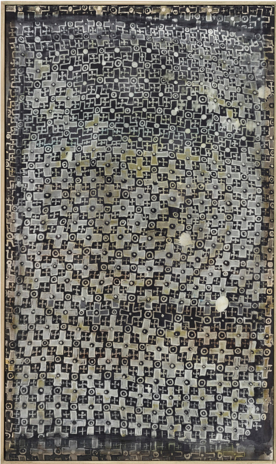
Stars Under Mud , 2015 batik, oil and fabric paint on silk 98 × 58 cm

The photograms are developed by means of an elaborate collage of positive and negative transparent foils that are directly placed on the photo paper, on which the actual picture is directly exposed. Bool replaces the interior view of the mannequins with architectural fragments of ornamental artefacts from New Guinea. They are depictions of so-called “Malu boards” which are part of the ritualistic “men’s houses” serving as the site of initiation rituals and symbolize the “archetypal woman”. Inserted in the silhouettes of the Siegel figurines, they lead to a dynamic “clash of cultures”, in which individual spaces of imagination and history are newly defined.