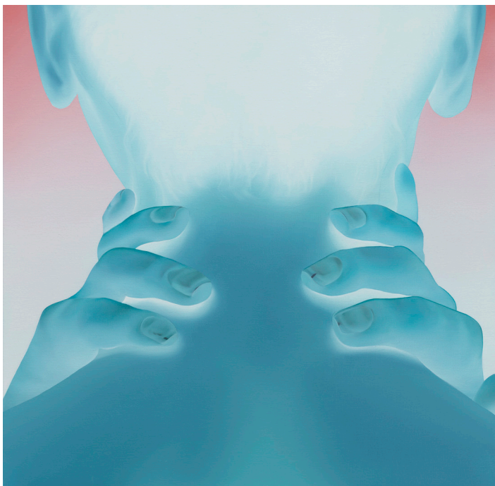
Opal , 2021

Vivian Greven constructs these motifs in glazed oil applied in layers like transparent veils. Similar to 16th-century Dutch painting, the gaze focuses on the trompe l'oeil of the fabric's structure and the incidence of light. At the same time, Vivian Greven shifts the viewer's perception away from the illusionist materiality to the haptics of the actual painting - the play between light and shadow, the consistency of the paint, the relations between the surfaces. This abstraction raises the "camel toes" above any kind of explicit obscenity. Painting becomes a "membrane" conveying new possibilities of defining and assessing bodies. "As far back as I can remember, I have painted bodies. The question of who or what I am has always been my driving force", says Vivian Greven. In her work, the body and its "corporeality" are key themes which she interprets in a positive way. Her painting simultaneously transcends its materiality to an ethereal sphere, where the naming and appraisal of different genders is open, as is the balance between.